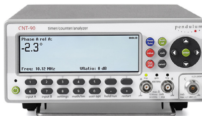
Figure 1: Display showing phase value, frequency, attenuation Va/Vb, and auxiliary parameters.

When adjusting a frequency source to given limits, the graphic display gives fast and accurate visual calibration guidance.