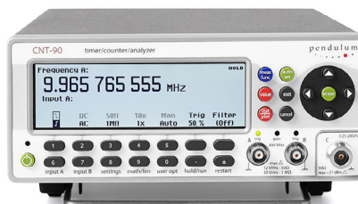
Figure 3: Input parameter setting menu shown with measured result.