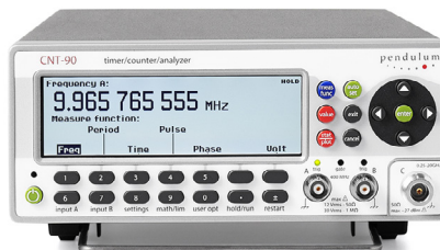
Figure 2: Measure function selection menu, shown with measured results.