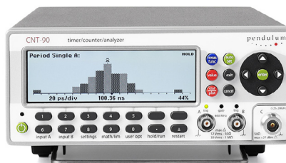
Figure 6: The same result as in Figure 5, now displayed as a histogram.